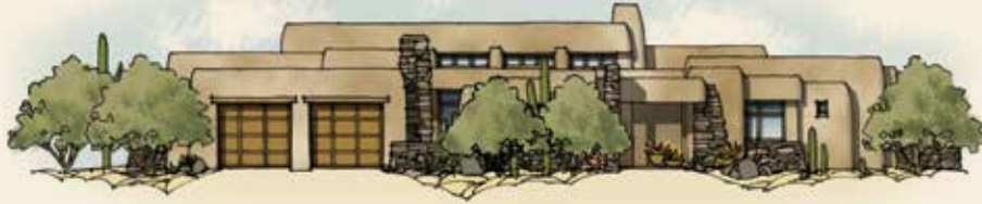
Contemporary Pueblo Optional courtyard fireplace shown

Our extensive custom-home gallery provides a broad range of floor plans and architectural styles. The Homestead floor plan is available in the four authentic styles shown below.