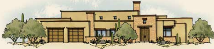
Tucson Territorial Optional courtyard fireplace shown