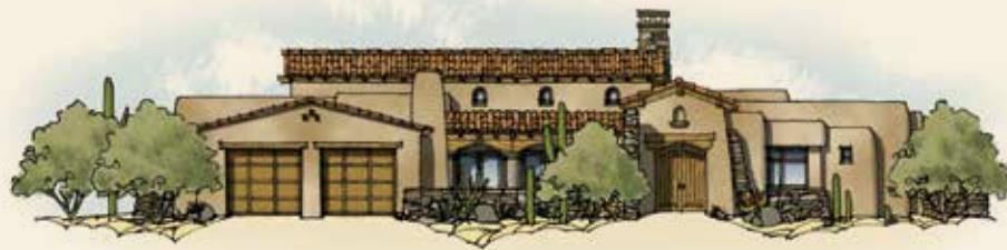
Desert Sonoran Optional courtyard fireplace and large-entry portal shown