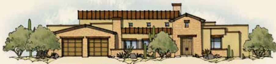
Arizona Ranch Optional courtyard fireplace and large-entry portal shown